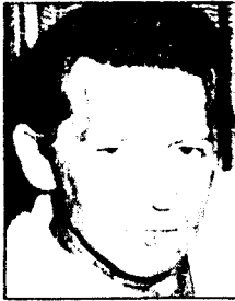
Jerry Lee Lewis

(The N/N connection here is just a little tenuous)