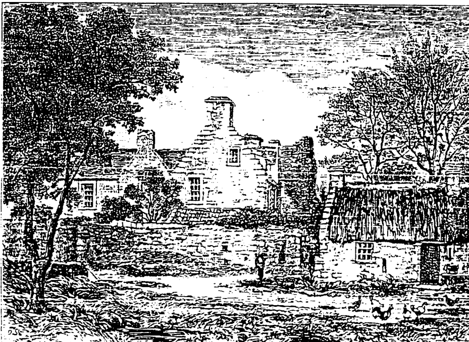
THE DEAN HOUSE, 1832. (After a Drawing by Robert Gibb)

The old House of Dean was demolished in 1845, to make way for the Dean Cemetery (open 9-5, dusk in winter). Although the house is long gone, many sculptured stones from it survive in the cemetery, which itself is well worth visiting for the romantic situation above the Water of Leith and its marvellous collection of Victorian monuments. Its an attractive (but steep) walk from the city centre, down through Dean Village and up to Dean Path.